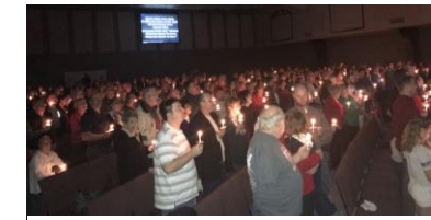
362 in attendance Christmas Eve