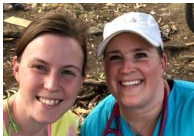
Medical Missions Team to the DR