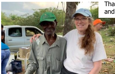
Thank you for your prayers and financial support!