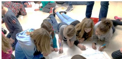
Teaching to be mature disciples!