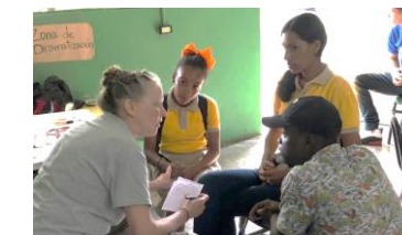
Welcome Back DR Team!